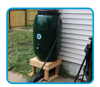
Level the area where the stand and barrel will be located. Place barrel on the stand beneath the downspout. Mark where to cut the downspout for the diverter or downspout elbow.