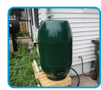
For winter maintenance before freezing temperatures, empty barrel and invert or divert water from barrel. Weigh down barrel if located in a windy spot.