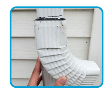
Cut the downspout with a reciprocating saw like a Sawzall or a hack saw. Make sure the cut is straight.