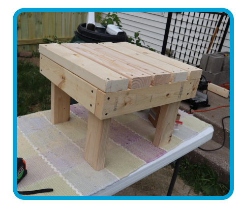
Measure across the frame from outside to outside (in this case it was 19.5"). Cut five boards and screw into the top of the frame.