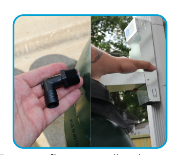
For overflow, install a diverter on the downspout that can be closed when the barrel is full. Or attach an elbow to the downspout and install an overflow fitting on the barrel to connect a hose to redirect overflow.