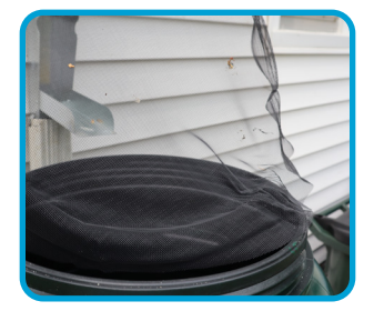
After installation, periodically remove debris from the screen on top of barrel. Replace the screen when necessary.