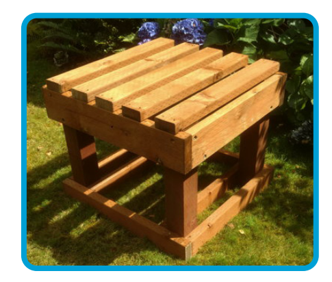
Cut four more 18" frame pieces and screw in at the bottom of the legs.