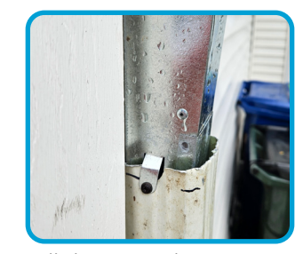
Install diverter (shown) by putting a sheet metal screws through the tabs and downspout, or downspout elbow with sheet metal screws and screwdriver.