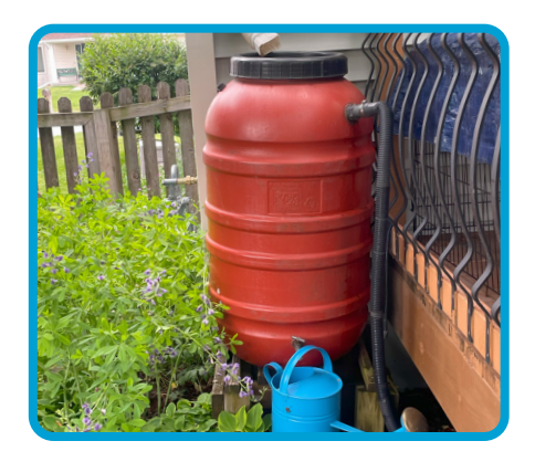
If preferred, you can sand, stain, and/or paint your rain barrel stand. Set up and enjoy your new rain barrel!