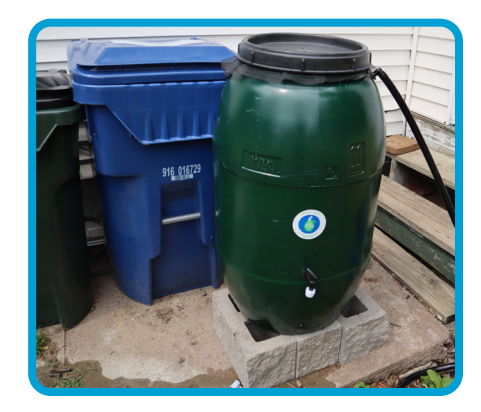
You can also make a stand out of cinder blocks! Make sure to level the area before placing the cinder blocks.